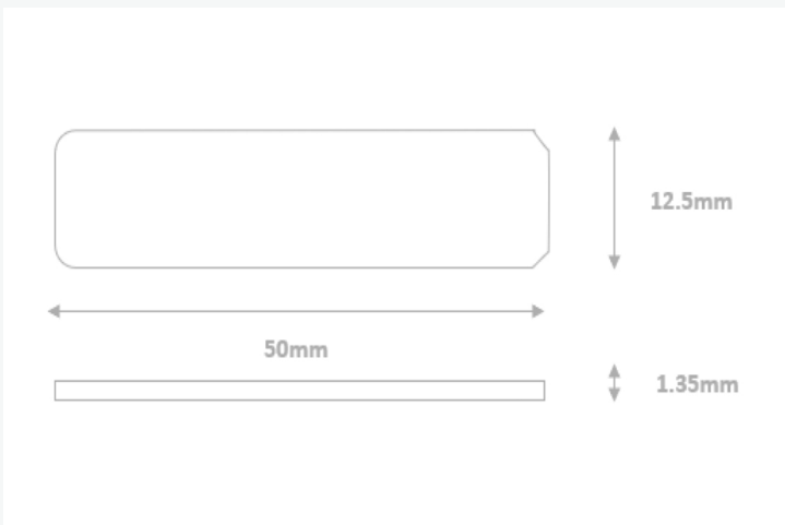
Measurements shown in mm